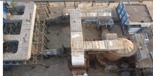
Wet Limestone FGD