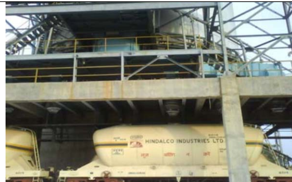
Railcar Loading System