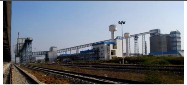
Wagon Unloading & Belt Conveyor