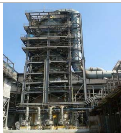
Dual Alkali Scrubber